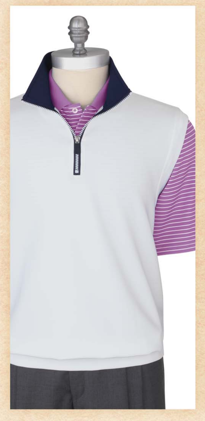
FAIRWAY & GREENE