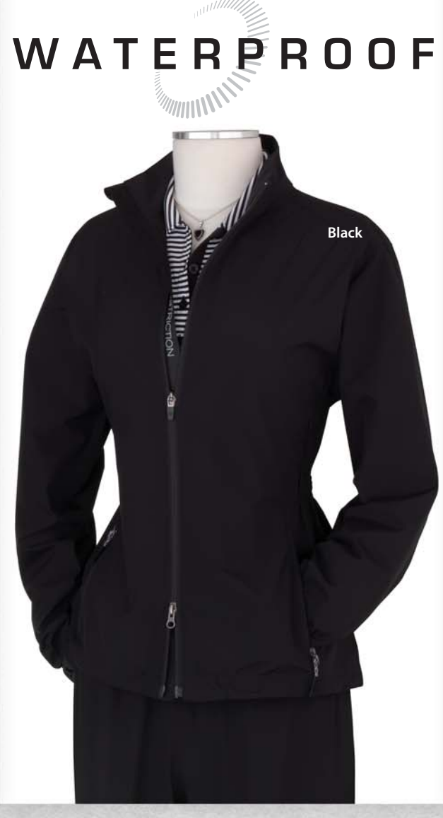
R242LC Ladies Laurel Waterproof Jacket Color: Black Sizes: XS-XXL Suggested Retail: $190.00